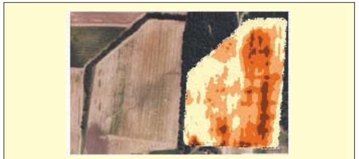
Figure 1. Aerial photo and EC map of a typical production field in the Southeastern Coastal Plain.

Our work during the past 12 years at Clemson University has shown that soil EC is positively correlated to percent clay, and negatively correlated to percent sand. Also, the overall EC