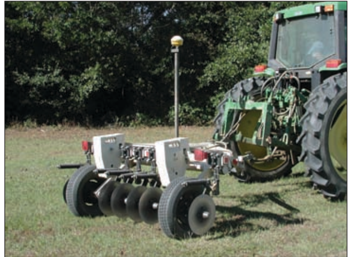
A view of the Veris 3100 soil electrical conductivity equipment.

Abbreviations and notes for this article: N = nitrogen.