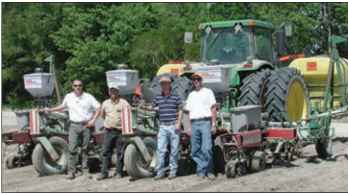
Farmers in South Carolina are finding practical benefits of information on soil electrical conductivity.

values increased with increased soil moisture, but the relative values remained consistent. The response curves were parallel for different moisture contents in all areas of the field.