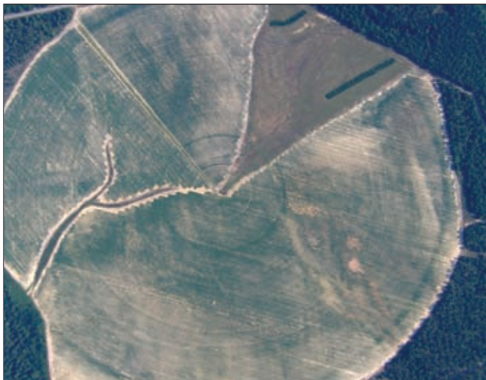
A typical production field in the Southeastern Coastal Plain, showing variation in soil texture.

Soil EC is an important characteristic that can be used to map the spatial variability of soil within a production field. Basically, soil EC describes the ability of a soil to transmit an electrical current. An EC mapping system is commercially available and many farms in South Carolina and other states are already using this technology for nutrient management.